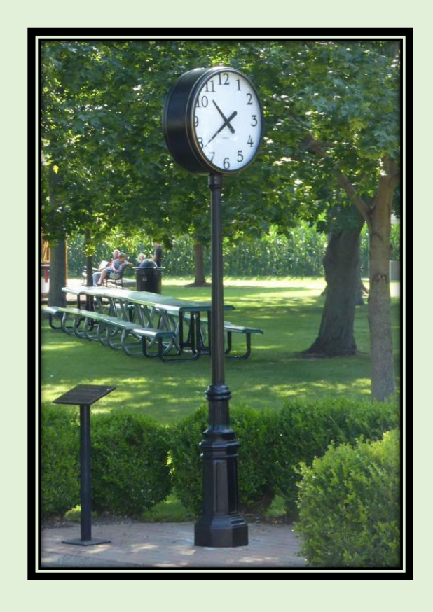
With a large selection of post, dial and hand designs to choose from, we are sure to find the perfect combination for you.